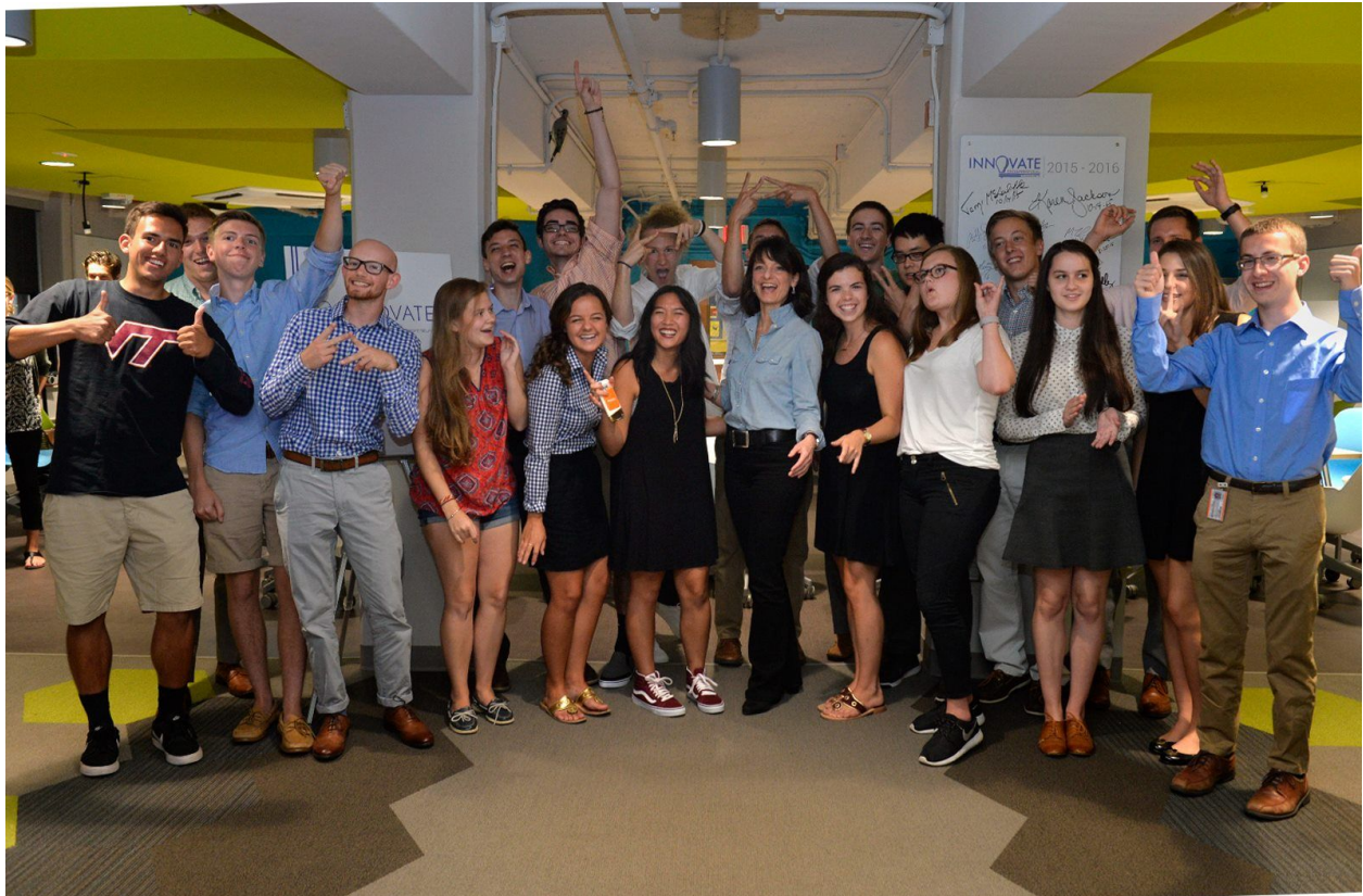
Apex Center students with Regina Dugan - Entrepreneur-in-Residence, VT alumnus; Former Director of Darpa and VP Facebook (Building 8)